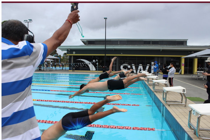
AND THEY'RE OFF!!!!!!