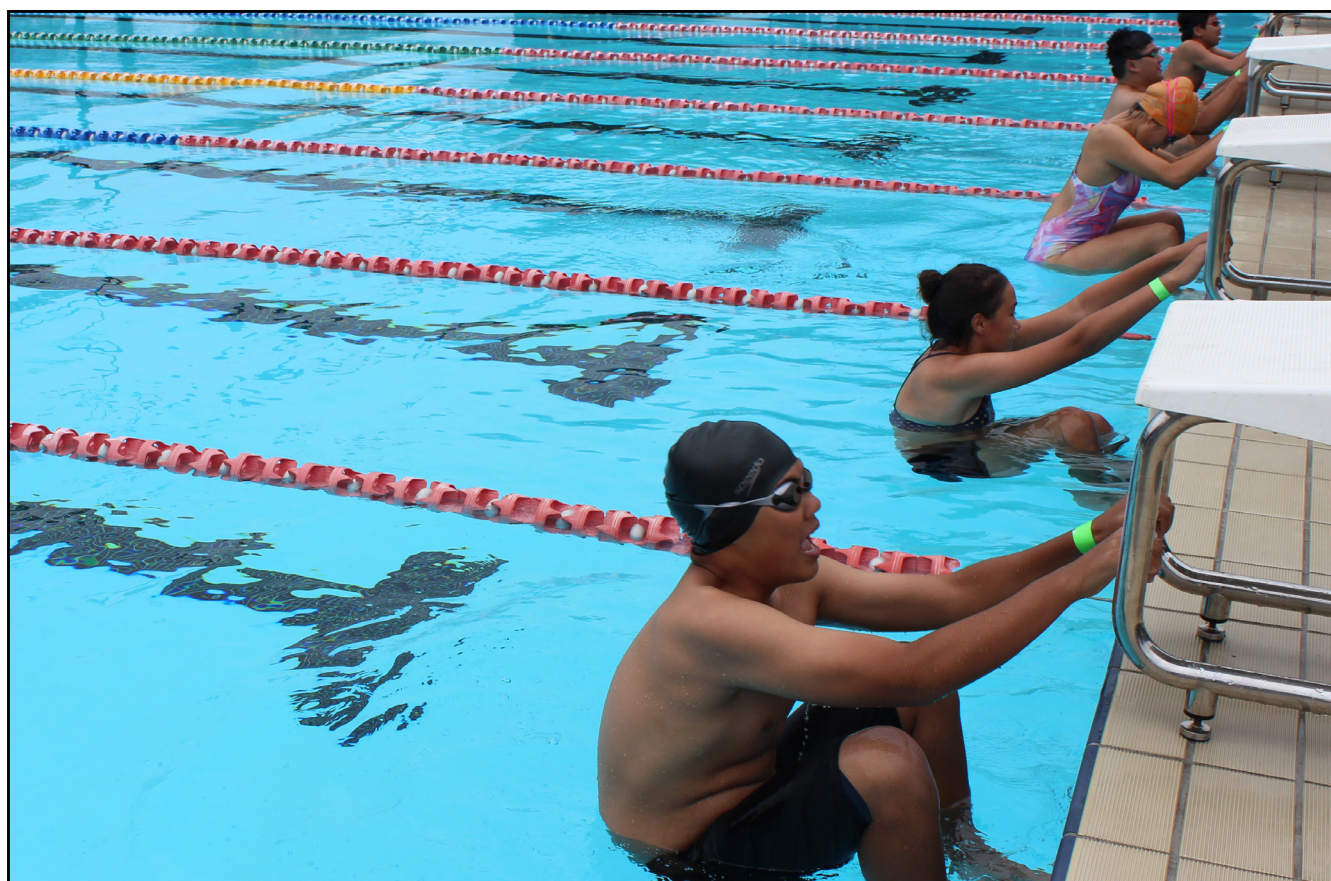
Mixed 50m Backstroke Final