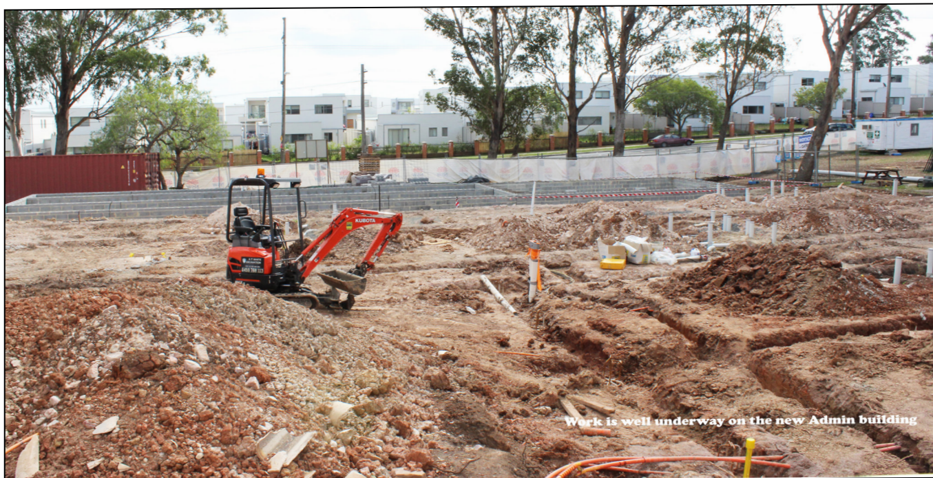
Work is well underway on the new Admin building