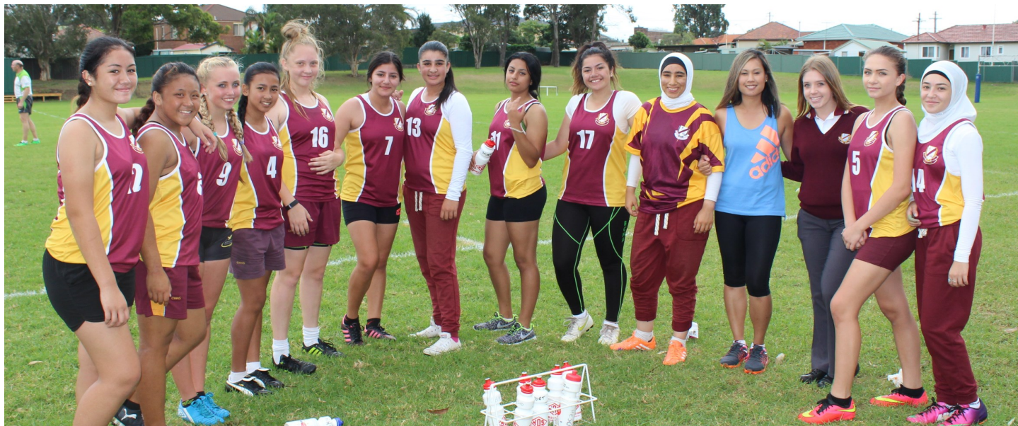
Touch Football Team Members