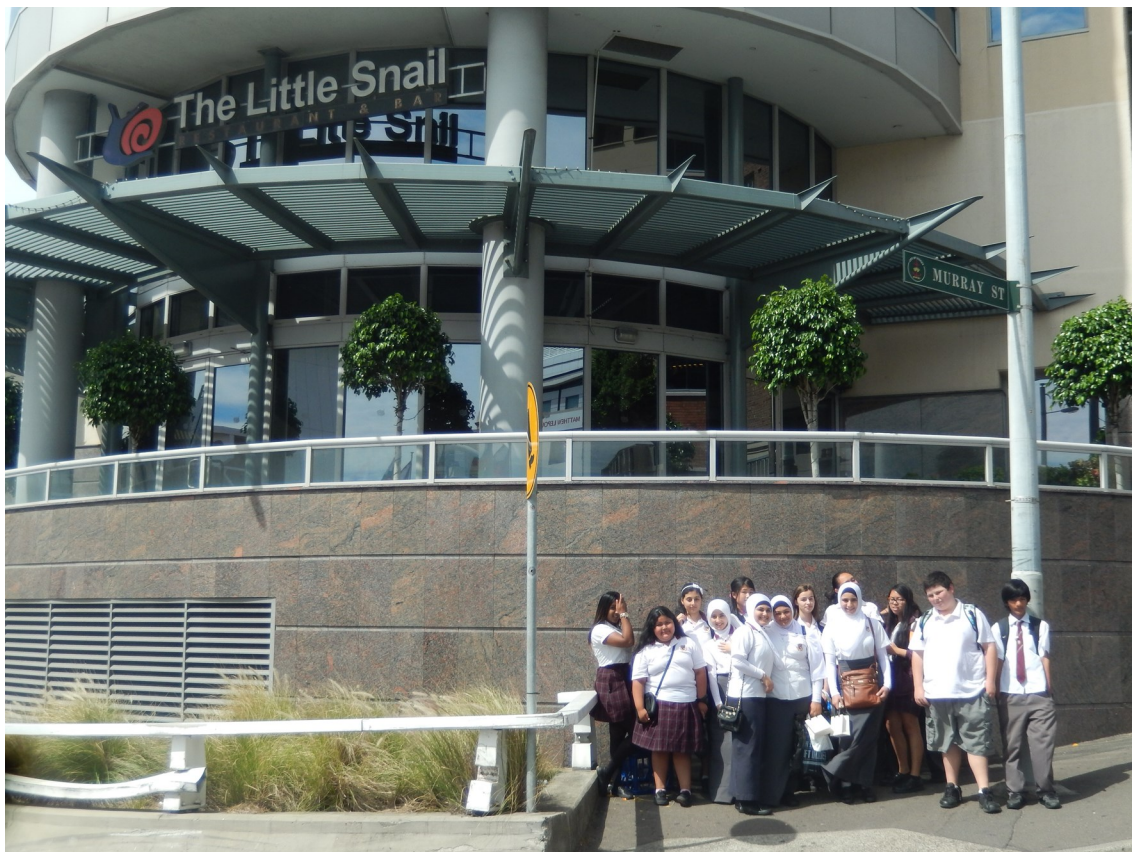
by Year 10 French students

It was a fantastic experience and really unforgettable. The whole class had a fantastic day and we really enjoyed the whole experience. "Vive les Escargots et la cuisine francaise"