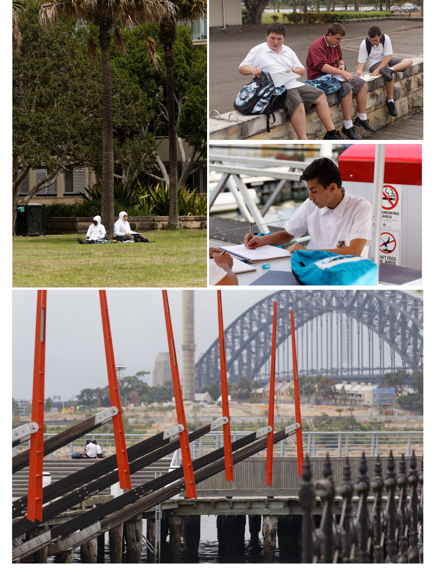
STRENGTH IN UNITY, EXCELLENCE IN EDUCATION