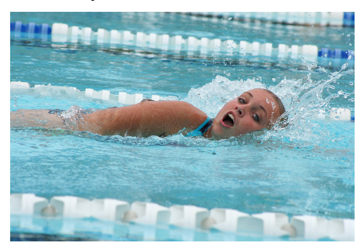
STRENGTH IN UNITY, EXCELLENCE IN EDUCATION