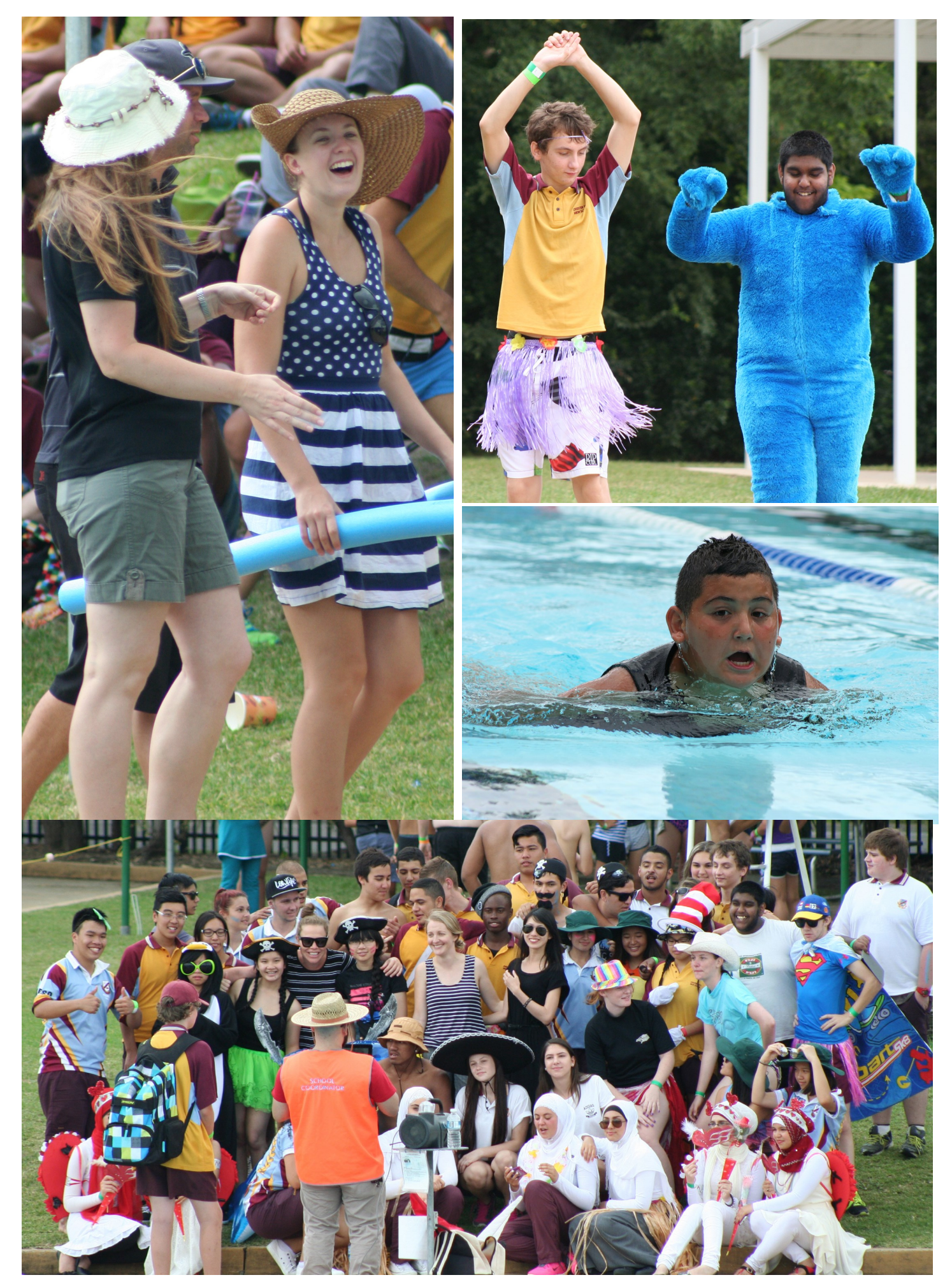
STRENGTH IN UNITY, EXCELLENCE IN EDUCATION