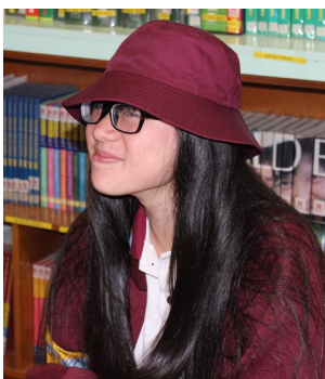
STRENGTH IN UNITY, EXCELLENCE IN EDUCATION