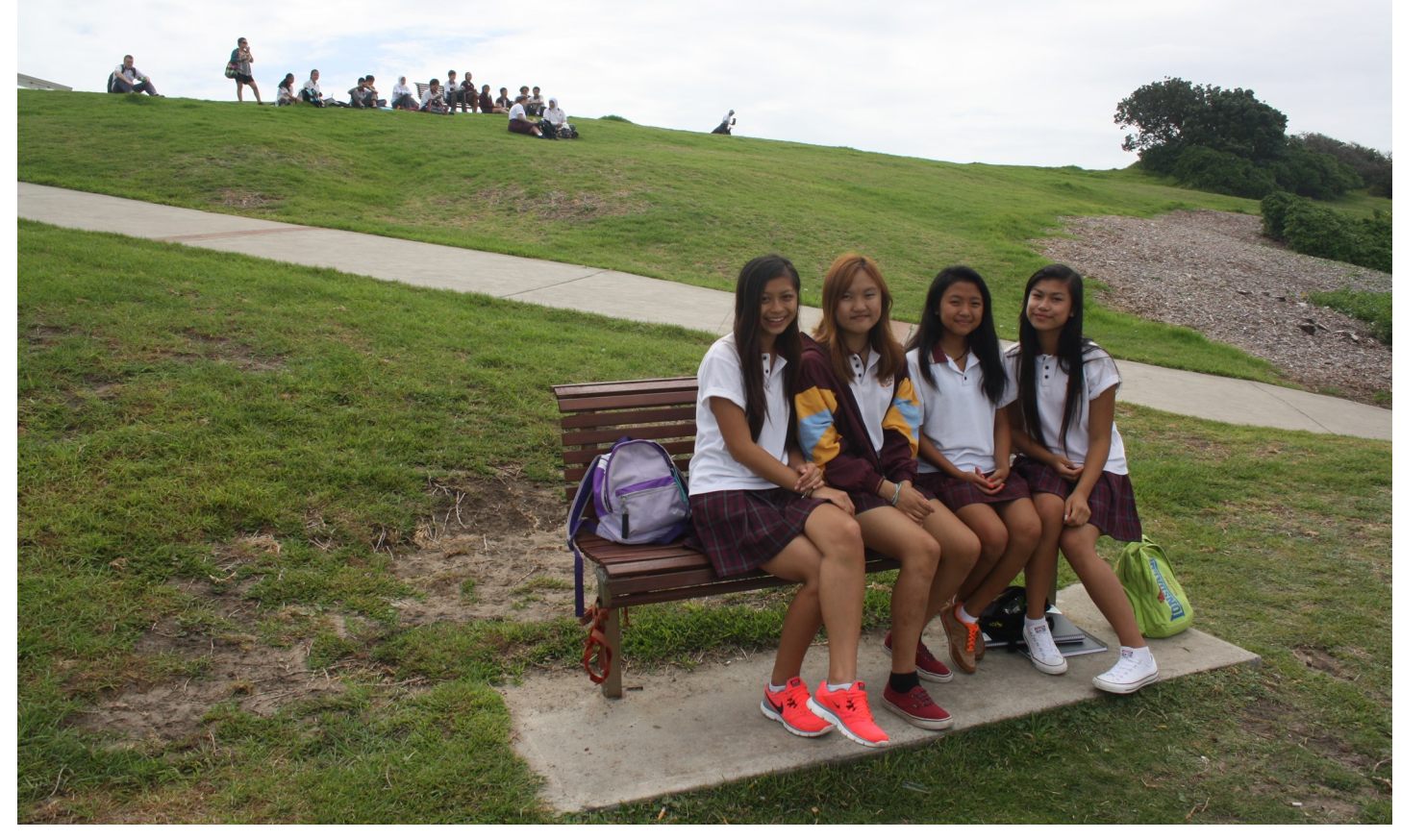
STRENGTH IN UNITY, EXCELLENCE IN EDUCATION