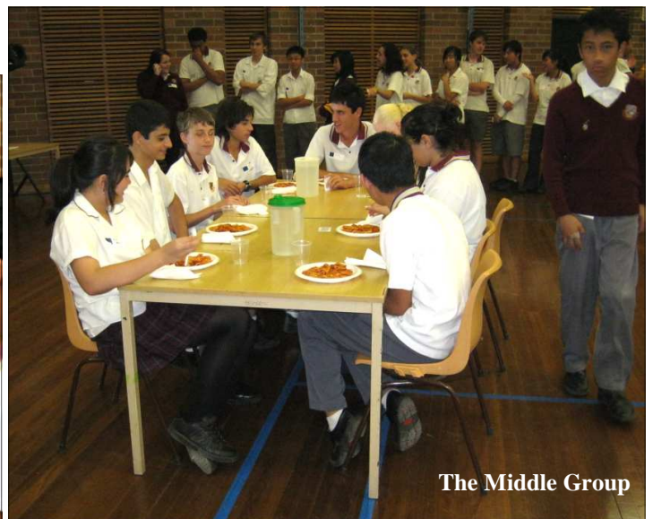
The Middle Group